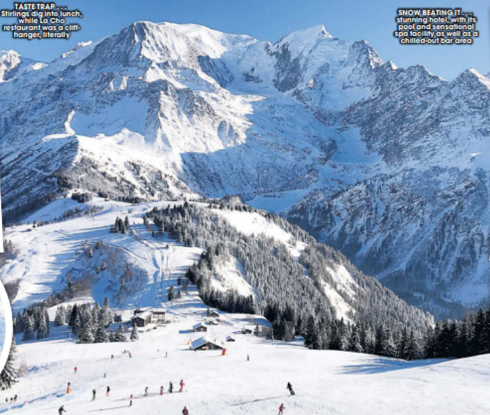
SNOW BEATING IT ... stunning hotel, with its pool and sensational spa facility as well as a chilled-out bar area